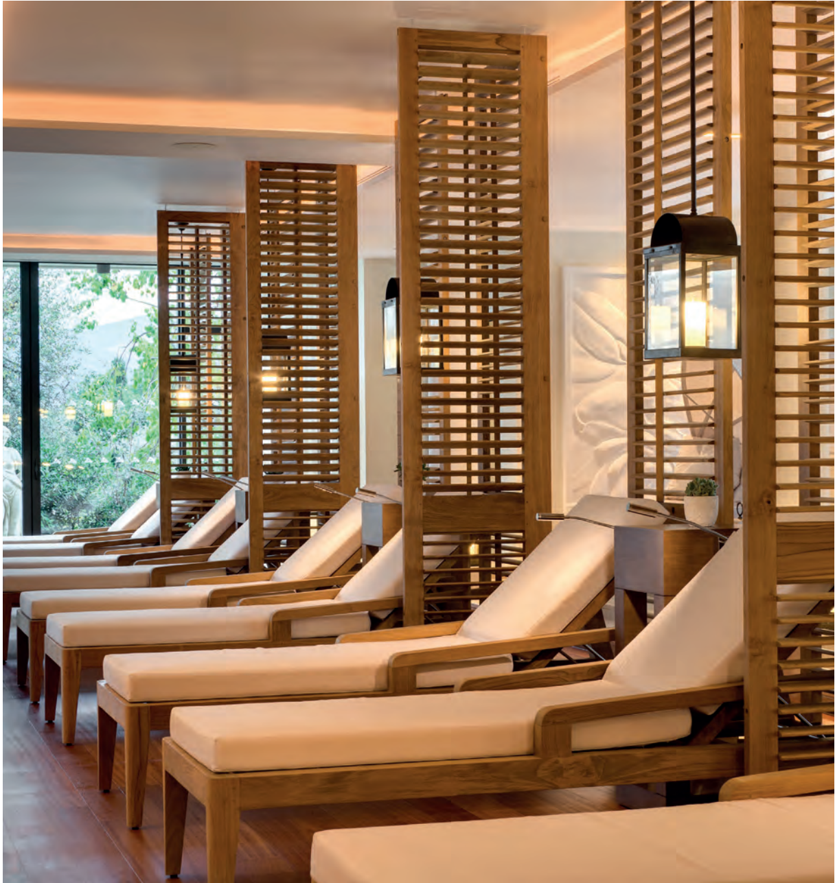
LE SPA access & Discovery days